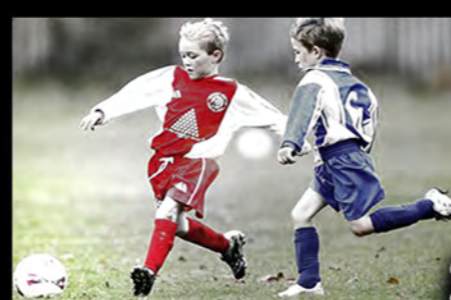
FOOTBALL PITCH - RECREATION AND PERFORMANCE SPACE